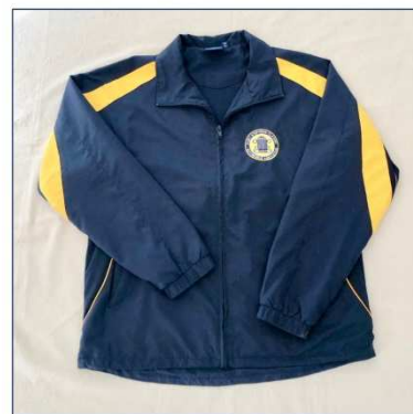
Jackets - $40