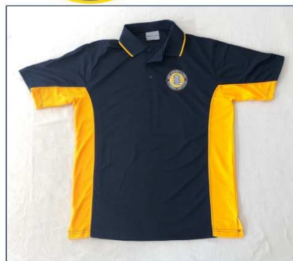
Polo Shirts - $30

Club Regalia - For Sale to Members (heavily subsidised by PSCAA)