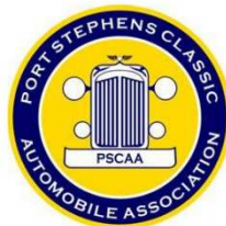
Hats – all $15